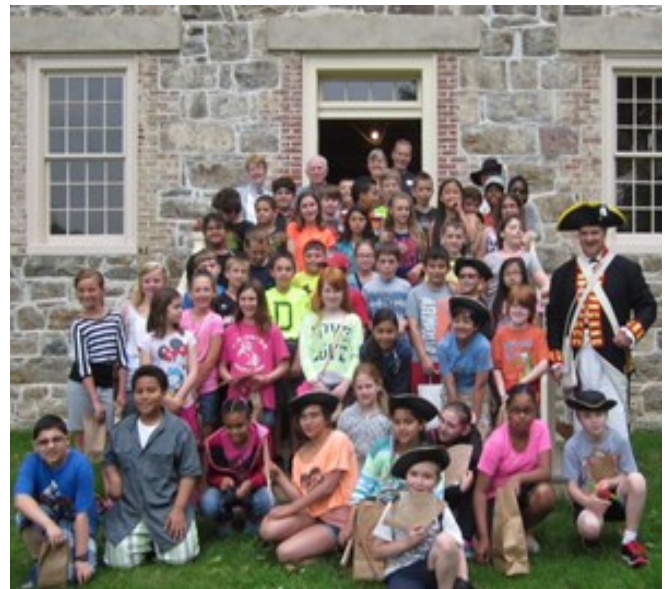
Dwyer School 4 th graders get a living history lesson at the Ford-Faesch House on Mt. Hope Road.

The Faesch House was also open to residents on July 4 th and 5 th in celebration of Independence Day. Members of the Historical Society provided history programs and tours at this time. The Historical Society will also be participating again this October in Morris County's "Pathways to History" program. For more information, please visit our website at www.rockawaytownship.org .