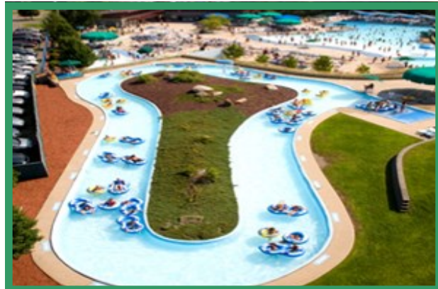
Frog Falls Aquatic Park, located on the grounds of Picatinny Arsenal.

Refunds will be granted to applicants if requested prior to opening day. A 20% administrative fee will be deducted from all refunds. No refunds will be given after the pool has opened for the season on May 24, 2014.