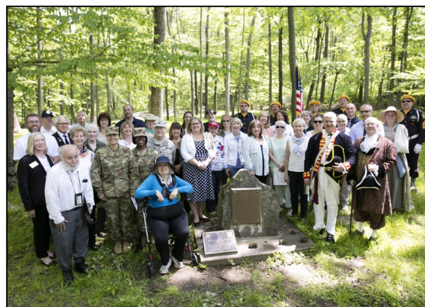
Representatives of Picatinny Arsenal, Rockaway Township, the Ogdensburg VFW and the Daughters of the Revolution dedicate the Walton Cemetery at Picatinny Arsenal.