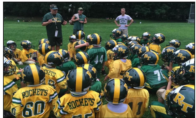
The Rockaway Township Rockets Football and Cheerleading program held their kick off pep rally on Friday, September 2 at Peterson Field. Participation from over 400 players and cheerleaders helped make the event a success!