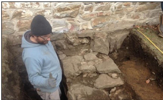
The foundation of the Ford-Faesch House's west wing was recently located and verified by Hunter Archaeology. It is believed the wing was removed in the late 1860s. For more information on the future restoration of the west wing, see page three of this newsletter!

Weight restrictions for single stream recycling are in effect. Please use either a toter style recycling can with the bar on the back filled to capacity (preferred) or regular style garbage cans weighing no more than 50 pounds each (including can). Additionally, please make sure your recycling is free of garbage, styrofoam and plastic bags. All cans must be labeled. Failure to follow these procedures may result in your can being rejected. It will be stickered accordingly to reference why it was not collected.