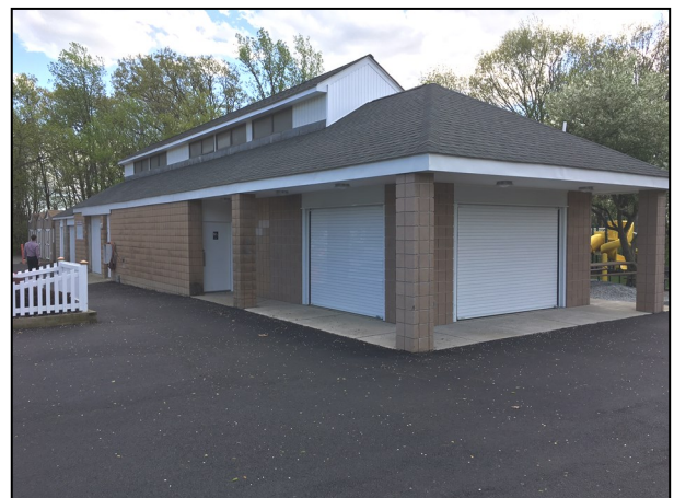
The Peterson Field concession stand project as of May 2. The ribbon cutting ceremony is slated for June 2017.