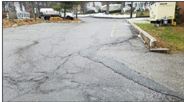
View of deterioration to the Senior Center parking lot. Grant-funded construction, commencing in May, will provide for necessary repairs.

Construction is anticipated to commence during the month of May. There will be closures to the side and lower parking lots at the Senior Center during the milling and paving operations, and limited access during drainage and curbing work. Township officials anticipate construction to be completed within two months. Thank you for your patience during this process.