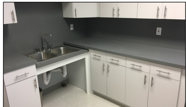
The remodeled kitchen at the Rockaway Township Health Center.

Thanks largely to a $79,340 Morris County Community Development Block Grant that municipal officials successfully applied for, the Rockaway Township Health Center, located at 419 Green Pond Road, received a significant interior facelift over the winter. The facility, which occupies space below the Hibernia branch of the Rockaway Township Public Library, includes exam rooms, receiving and waiting areas, storage space, offices, rest rooms and space for educational programming. The work consisted of necessary repair to floors, walls and ceilings, painting, cabinets, counters and other cosmetic restoration. It is anticipated that the Health Center will reopen in June 2017, with a ribbon cutting ceremony at a date to be determined.