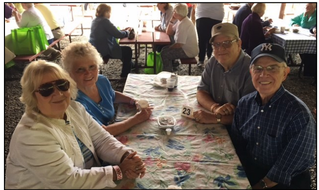
Rockaway Township residents enjoy the 2017 Senior Picnic. This year's event takes place on Friday, September 14.

The Annual Senior Picnic is open to all Rockaway Township senior residents, and proof of residency will be required at the gate. No pets or children will be allowed in the park at this event. For additional information, please contact the Office of the Mayor at 973-983-2800. We look forward to seeing you there!