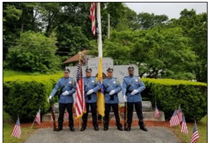
Members of the Rockaway Township Police Department attend the 2018 Memorial Day Parade.

I hope that you enjoy this issue of the Rockaway Township Report . Don't forget to like us on Facebook, and be sure to visit www.rockawaytownship.org for news and events. Have a great summer!