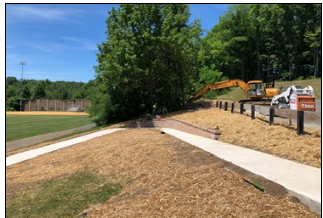
Before and after: Newly installed accessible ramp at the Peterson Field Complex between the middle parking lot and field level.