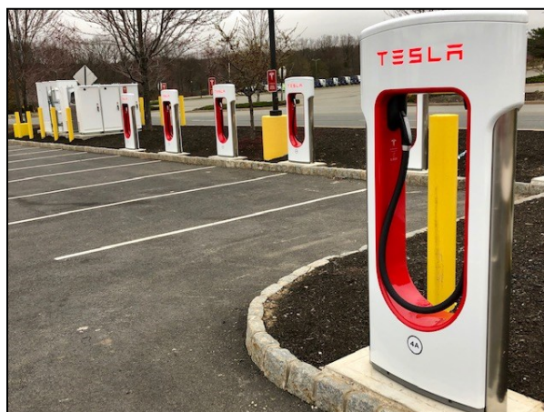
The new Tesla charging station, consisting of 12 superchargers, is up and running adjacent to the AMC Rockaway 16 Theaters.

Finally, Marcade Family Fun Center, located at the Rockaway River Commons, 437 Route 46, had its grand opening on April 12. The entertainment center features dozens of arcade games and party accommodations. Its location assures plenty of parking for pinball and Pac Man enthusiasts.