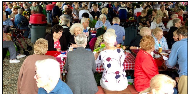
Rockaway Township residents enjoy the 2018 Senior Picnic. This year's event takes place on Friday, September 13.

All Rockaway Township senior residents are invited to our Annual Senior Picnic, scheduled from 10:00pm - 2:00pm on Friday, September 13 at the Craigmear Recreation Complex. Delicious food, music and good fellowship will be offered to the Township's senior residents. Representatives from municipal departments, health agencies and area organizations will be present to meet with residents and to disseminate information. The Annual Senior Picnic is open to all Rockaway Township seniors, and proof of residency will be required at the gate. No pets or children will be permitted at this event. For additional information, please contact the Office of the Mayor at 973-983-2800. We look forward to seeing you there! Please note: Rain date is September 20.