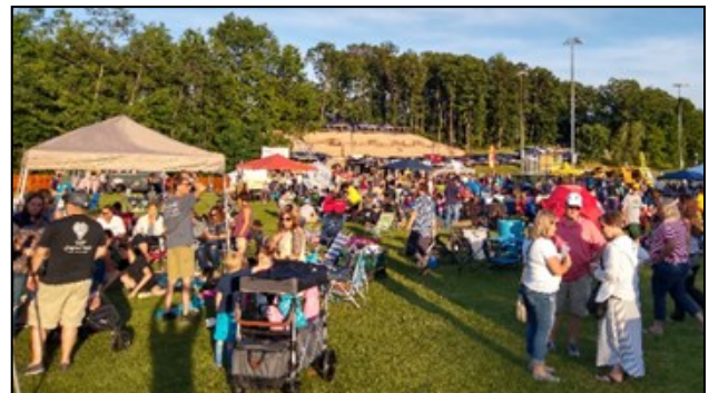
An estimated several thousand Rockaway Township residents attended a fun-filled Rockaway Township Day on Saturday, June 8. The event featured fireworks, crafts, pony rides, vehicle exhibits, Mayoral presentations, over 20 food vendors and many smiles.