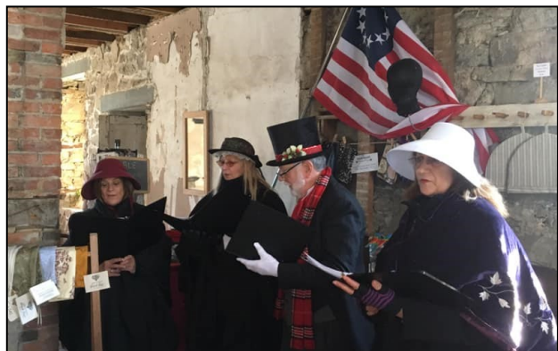
Rockaway Township Historical Society members held the Historic Victorian Christmas event at the Ford-Faesch House on December 7, 2019, featuring games and a recreation of Santa's visit to the children of miners.

The Construction Department is here to assist you in following all applicable State and municipal regulations. Should you require any assistance, please don't hesitate to contact us at 973-983-2809, or email us at: construction@rockawaytownship.org .