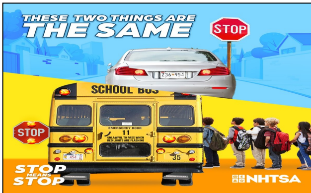
The Rockaway Township Police Department reminds residents that passing a school bus is a threat to children and their caretakers - and is illegal. Please drive safely!