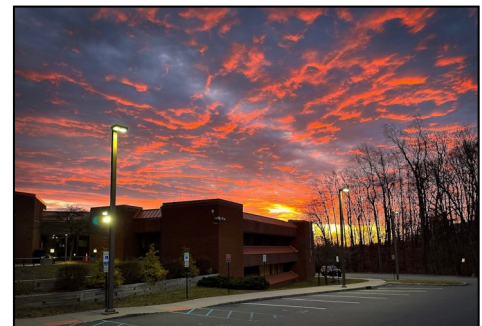
Division of Parks employee Morgan Morris captured this lovely photo of a moody sunrise over the Township Municipal Building.