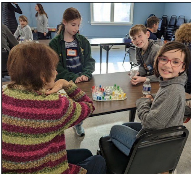
Township elementary school students and seniors recently spent an afternoon enjoying snacks and board games at the Senior Center. It was a multi-generational afternoon full of fun and smiles.